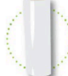
Pallet wrap & stretch film