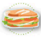
Ziploc & other redosable food storage bags